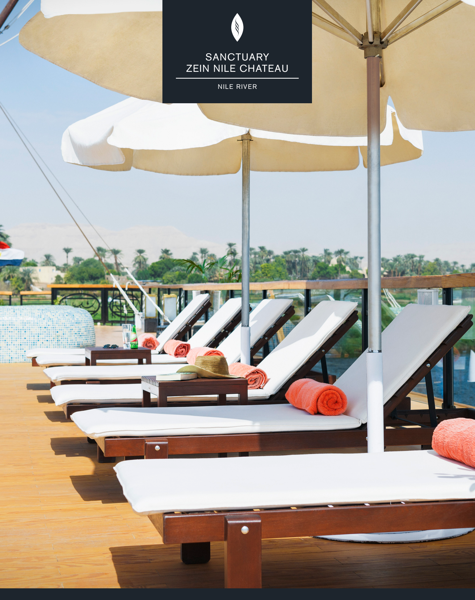
EGYPT: 6 CABINS