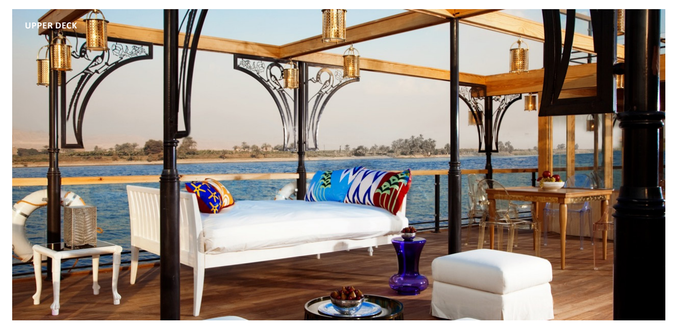
Please Note: Wi-Fi strength unavoidably varies depending on geographical locations, especially whilst sailing in the more remote areas of Upper Egypt.

Afternoon tea and dinner on board. Overnight in Esna.