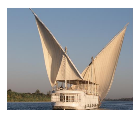
Sailing from 2001 Lazuli: the name of the Dahabieh comes from the precious stone - the lapis lazuli.