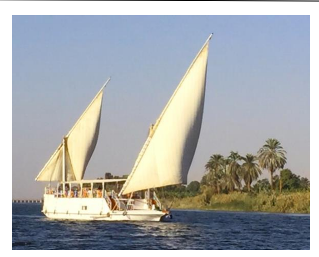
Sailing from 2010

12 passengers capacity Five, Four and Three Nights Itineraries