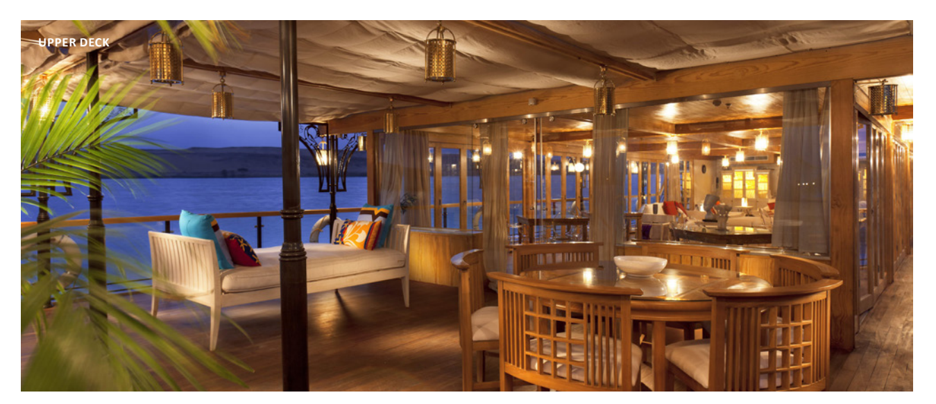
Please Note: Wi-Fi strength unavoidably varies depending on geographical locations, especially whilst sailing in the more remote areas of Upper Egypt.