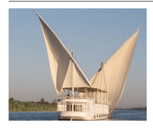
Sailing from 2001 Lazuli: the name of the Dahabieh comes from the precious stone - the lapis lazuli.