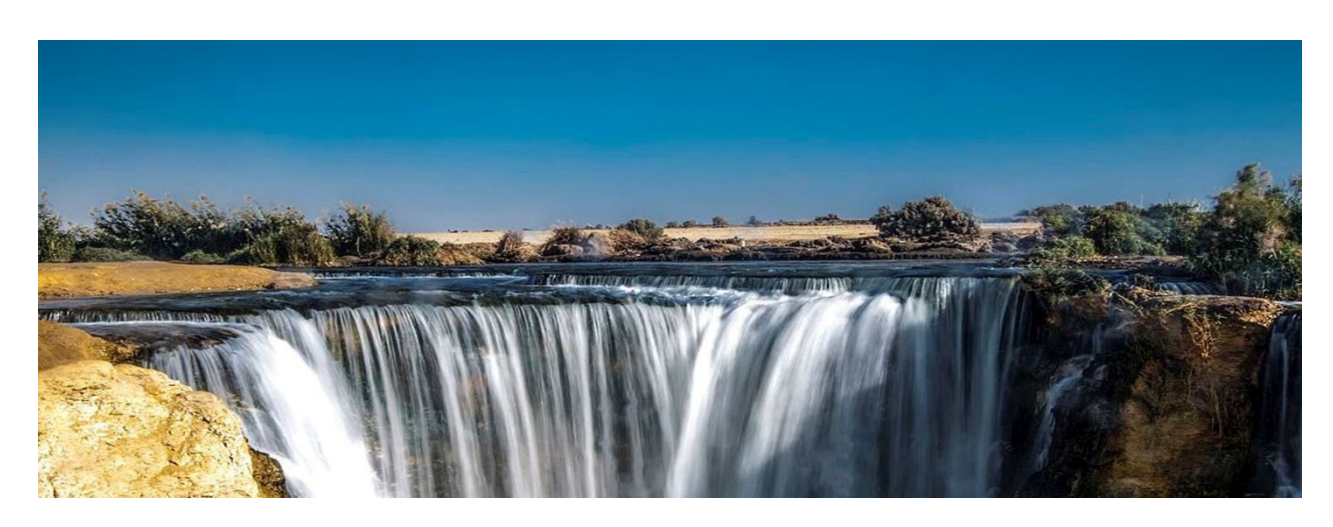
Fayoum Extension 3 Days / 2 Nights